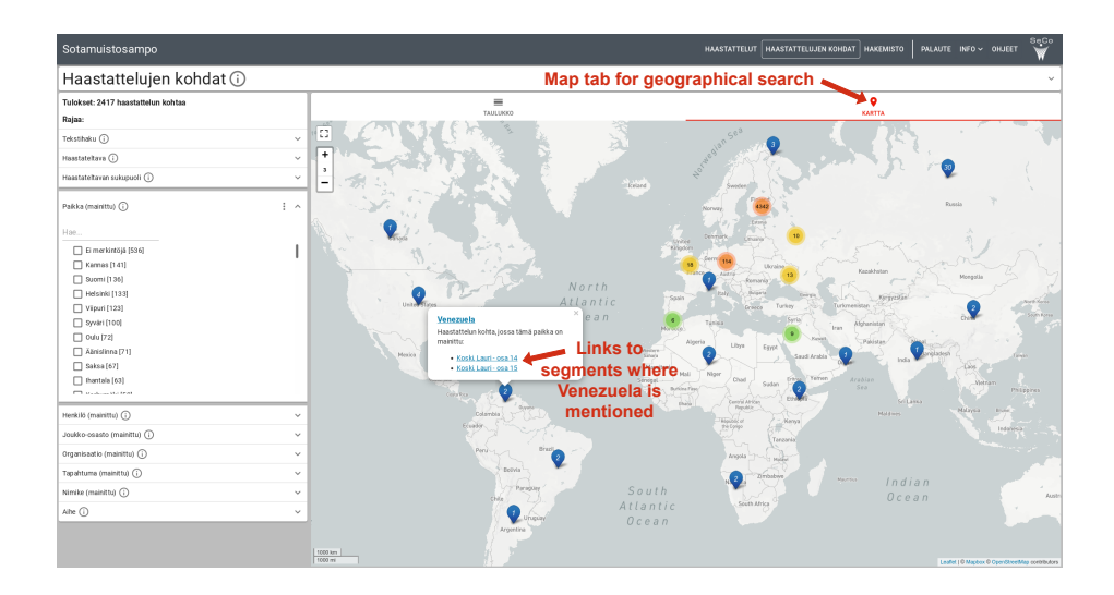
Fig. 3. An exploratory search scenario in the WARMEMOIRSAMPO portal where the map view is selected to access the segments that mention a specific place.