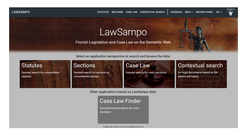
Figure 2: LAWSAMPO landing page with five application perspectives

The landing page of the LAWSAMPO portal depicted in Fig. 2 offers five different application perspectives. Semantic faceted semantic search is used for filtering data of interest out after which the data can be either browsed or analyzed using a set of seamlessly integrated data-analytic tools. The five application perspectives are explained below.