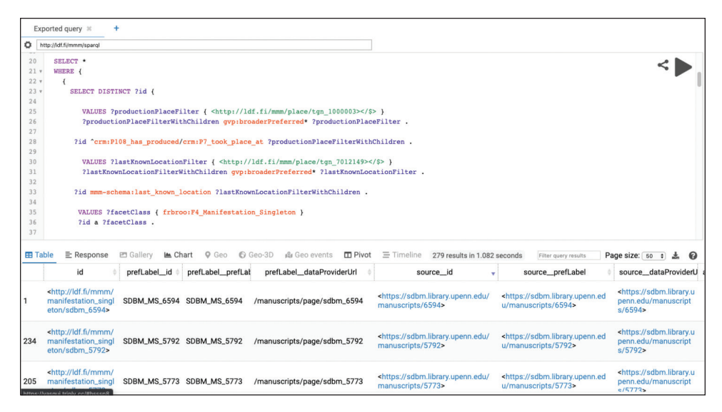
FIGURE 5. The result set from figure 2 as it appears in the Yasgui query service, where users can download the data.

tabular view of the result set, which can then be downloaded as a CSV, XML, or JavaScript Object Notation (JSON) file (fig. 5).