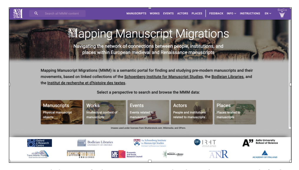
FIGURE 1. The home page for the MMM semantic portal, with icons directing users to the five data perspectives.

University and the Helsinki Centre for Digital Humanities (HELDIG).<sup>15</sup> It works by constructing SPARQL queries against the Linked Data service and presenting the results in a user interface that allows for browsing and searching. Five basic perspectives on the data are available, based on the main classes of entities: Manuscripts, Works, Events, Actors, and Places (fig. 1).