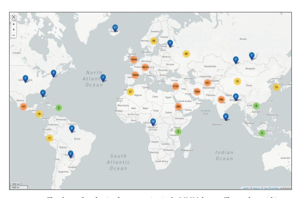
FIGURE 3. The places of production for manuscripts in the MMM data set. The numbers within each marker indicate the number of manuscripts produced in that region or location. Some coordinates are approximate.