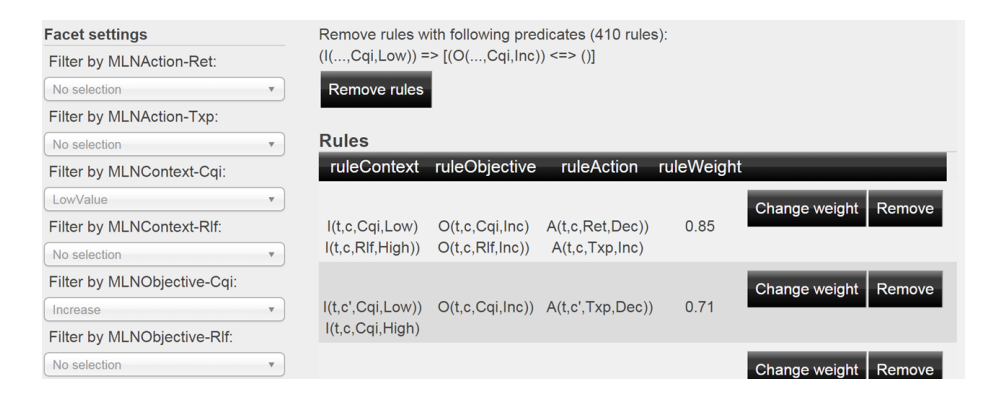
Fig. 3. Faceted search for uncertain rules

The facets are generated as a combination of rule classes (context, objectives and actions) and their objects (CQI, RLF, TXP, and RET). Here the operator has filtered out rules containing low CQI in the context part and increase CQI in the objective part. The result indicates that every single rule can be removed or its weight can be updated. The possibility to remove a set of rules that satisfies current facet selections can be seen above the result table.