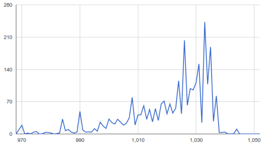
Fig. 2. Average migration count of very large birds in relation to air pressure [hPa].

The research hypothesis behind our second visualization is that air pressure affects the migration of very large birds. However, it is unclear how much it affects, if at all. To solve the problem, the characteristics ontology of bird species is needed telling the sizes of different species, in addition to bird observation and weather data. Figure 2 plots as an example the migration counts of very large birds on Y-axis. The average air pressure of the days in which the migration was observed is represented in the X-axis. The migration counts have been normalized to give the average migration count for each day with a certain average air pressure.