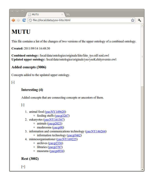
Fig. 2. The aFdded, interesting concepts of the HTML change list. The bulletin-listed concepts are the nearest connecting concept children of the added concept.

In our case study, we used the Finnish General Upper Ontology YSO [1] as the upper ontology and the Business Economy Ontology LIITO<sup>3</sup> as the domain ontology. Both ontologies are in active development and there is a new release of YSO quarterly. LIITO contains almost 3200 concepts, the old version of YSO contains 20700 concepts and the updated YSO contains 23600 concepts.