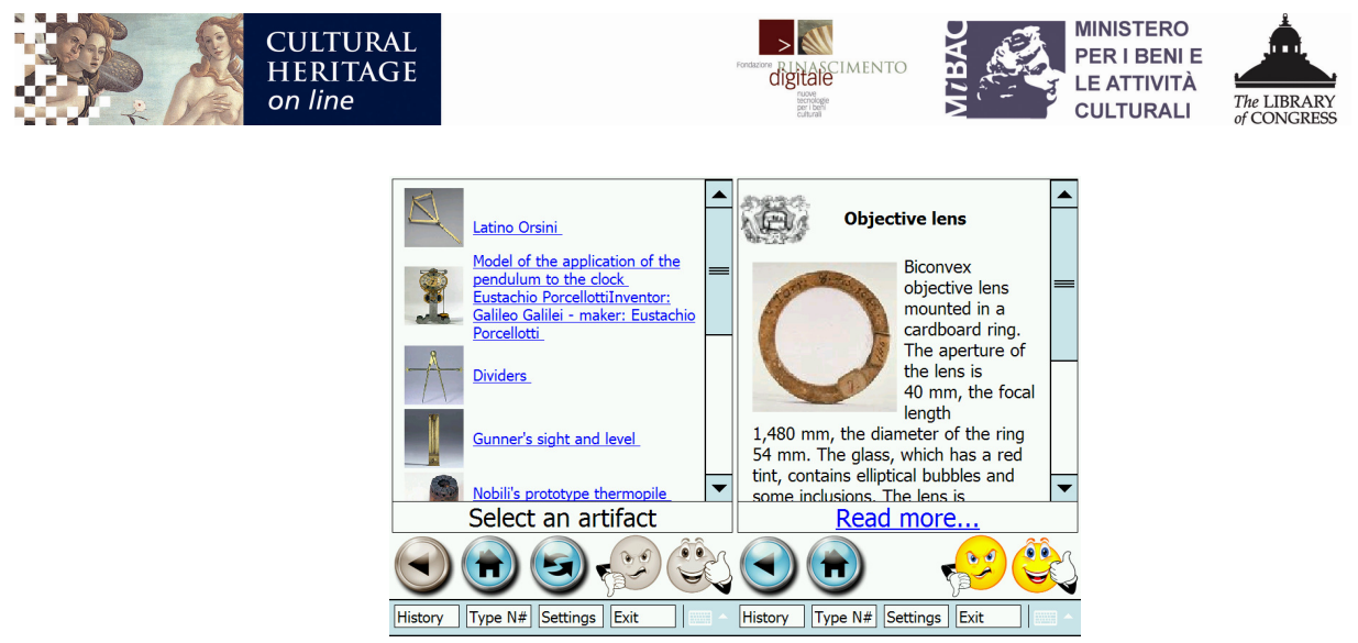
Figure 2: Mobile device main UI (WiMo)