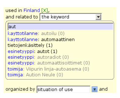
Fig. 2. The view-independent semantic autocompletion component of the Culture-Sampo exhibition specification interface.

View-Independent Semantic Autocompletion The multiple views in the view-based search paradigm make it easy for users to browse their options. However, for users knowing precisely what they want, a shortcut and a single point of entry is desired. In our system, this is accomplished by a semantic autocompletion [17] component, shown in figure 2.