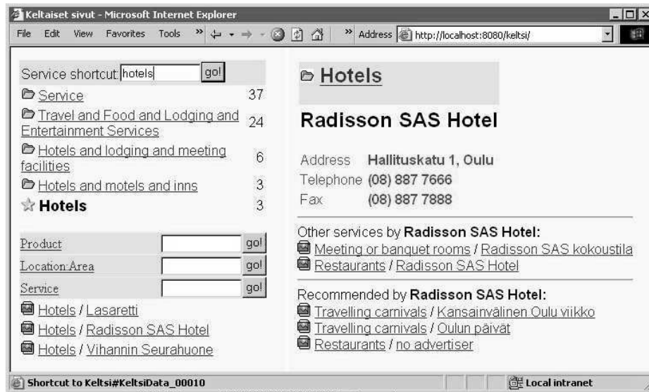
Fig. 2. The user interface is divided into two parts: on the left hand side is the ontology-based searching tool and on the right is the semantic instance browser.

classes until the service class that best describes user's need is found. The class can be a very specific class, such as "Restaurants", or a more general class, such as "Eating and drinking establishments", which contains also bars, fast food services, etc. in addition to restaurants. The ontology class can alternatively be selected by writing the name of the class in the shortcut field, which makes the tree open up from the matching part. On the right of every ontology class, the number of corresponding service instances (advertisements) is shown. For example, the class "Services" has 37 instances connected to it and the class "Restaurants" has 10 instances.